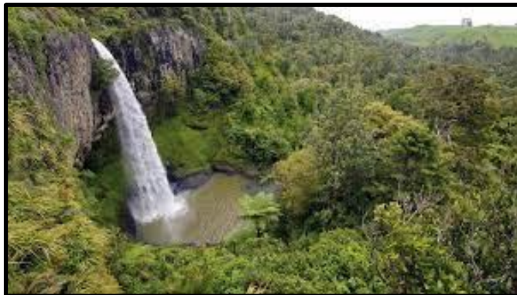
Bridal Veil Falls