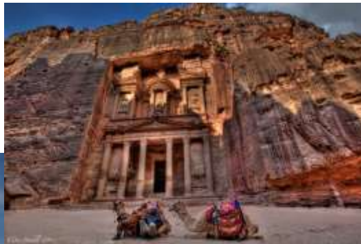
The Treasury, Petra