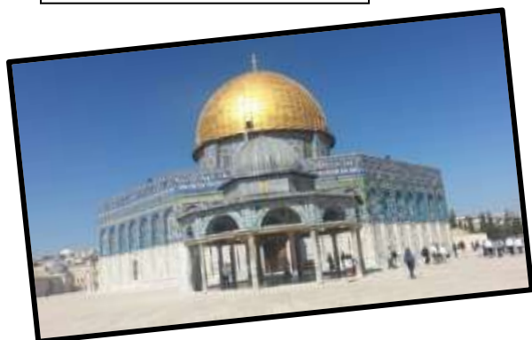
Temple Mount, Jerusalem