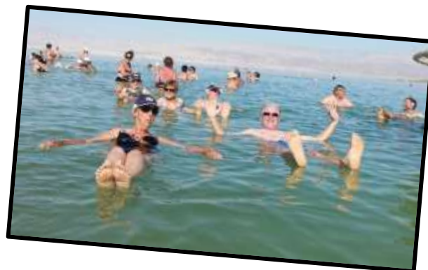
Swimming in the Dead Sea