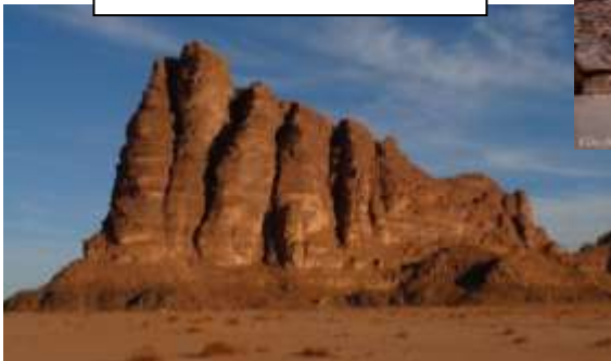
The Seven Pillars of Wisdom, Wadi Rum

There is good drinking water available and the cuisine of the country is typically Arabic, wholesome and delicious. Shish kebabs, hummus, falafel, salads, grains, mezze, chicken and lamb all feature.