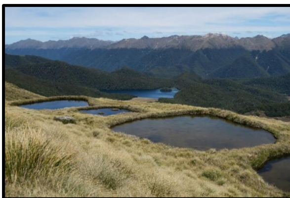
Mt. Burns Tarns