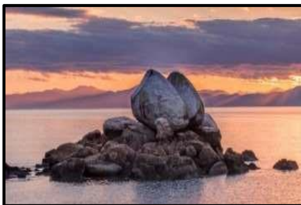
Split Apple Rock