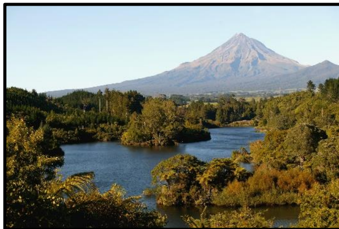
Lake Mangamahoe and Mount Taranaki