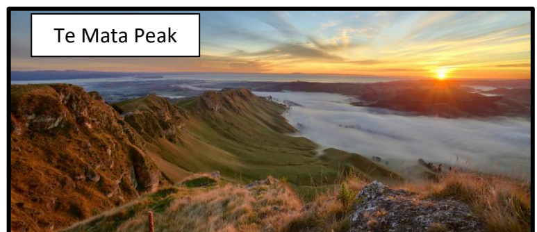
Te Mata Peak