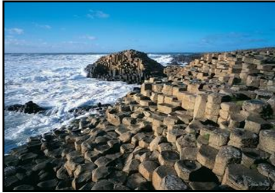
The Giant's Causeway