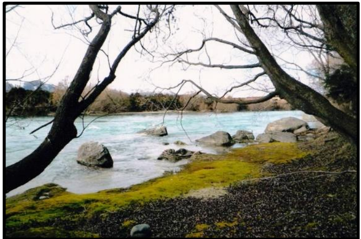
Clutha River Trail